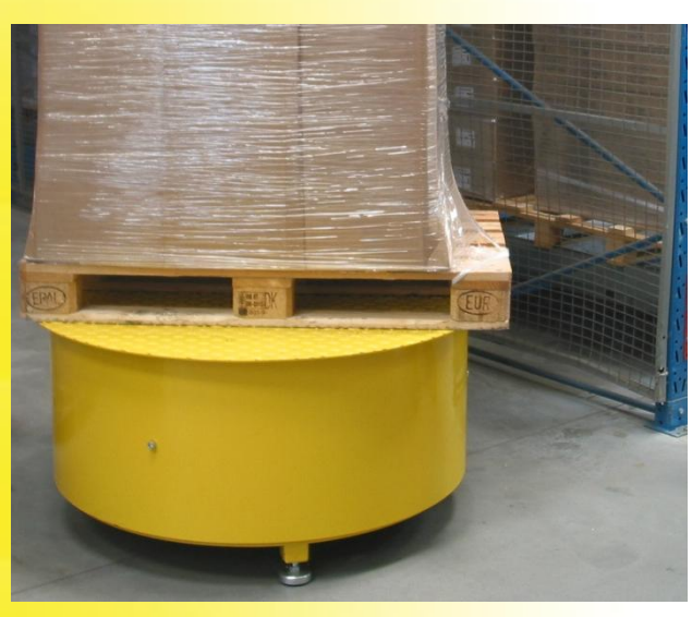
Place the pallet on the pallet turner